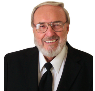
Yisrayl Hawkins THE HOUSE OF YAHWEH

The King James Bible and all other versions are just that, they are versions of The Book of Yahweh .